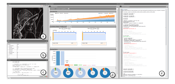
Figure 1: The interface of our integrated system: (a) shows a domain view that depicts the output of a Sobel filter and highlights corresponding to the hovered visual element, (b) shows a global variable view, (c) shows a console, (d) shows the visual explorer with different analysis views, (e) shows the source code editor with highlights that also corresponding to the hovered visual element.

Visualization Framework: The resulting data that was generated during the execution of the kernel is visualized using a powerful framework capable of static as well as interactive visualizations. By linking the visualizations with source code, we provide insight into the program's structure, execution, and memory access patterns.